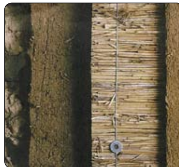
Claytec reed board with clay plaster finish

The boards are easily cut with a metal blade jigsaw. A side-cutter can be used to cut through the wires which bind the reeds together.